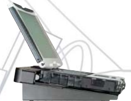
Flat Surface/Trunk Docking Station