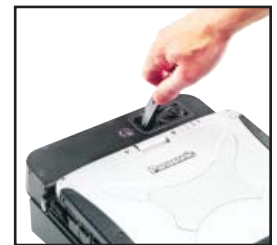
Easy-to-use "lift-and-turn" compression latch