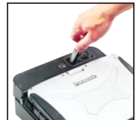
Easy-to-use "lift-and-turn" compression latch