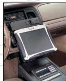
Vertical Tablet Position